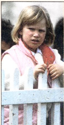
■ Zara Anne Elizabeth, the Princess Royal's second child, was born on May 15, 1981.