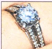
■ Mike Tindall had the diamond and platinum engagement ring made by a jeweller.

Mike's England team mates are all expected — including former player Austin Healey,