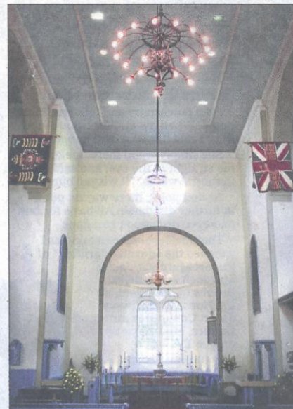
■ The simple decor inside the church.