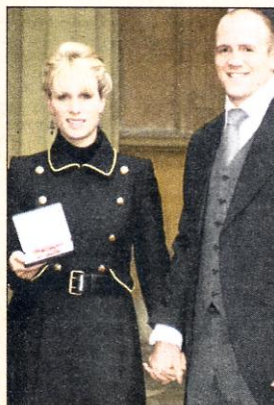
■ In 2007, Zara received an MBE for services to equestrianism, from her grandmother the Queen.