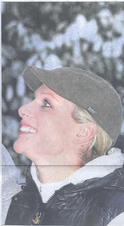
their engagement on December 21 last year.