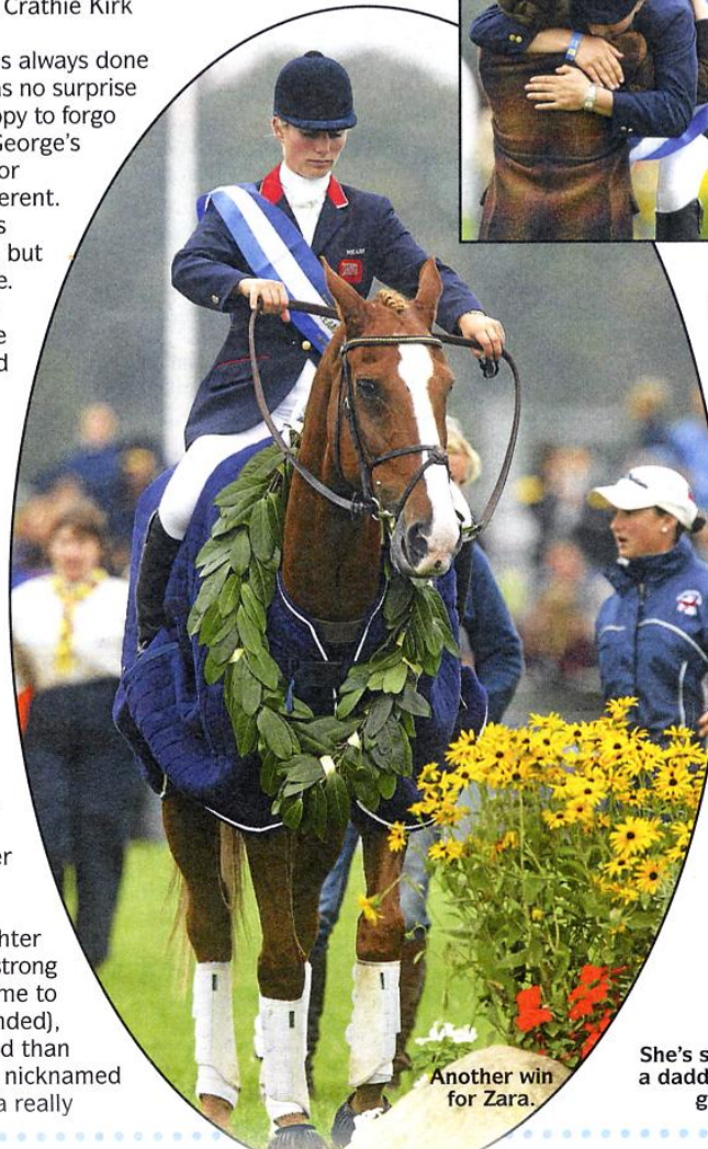
Another win for Zara.