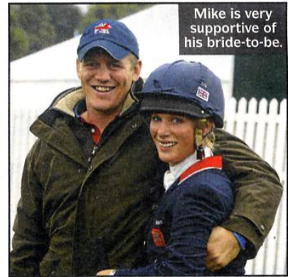
Mike is very supportive of his bride-to-be.