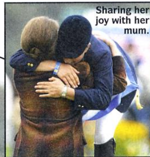
Sharing her joy with her mum.

The newlyweds won't have much time to settle down, though, as Zara has one other award she desperately wants to achieve — an Olympic gold medal. With Mike backing her all the way, that really would be the icing on their wedding cake! ●